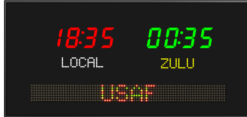
Model 6619E - 2.5" time, 1.2" zone labels, 2.0" dot matrix message display 24" wide, 2 zones